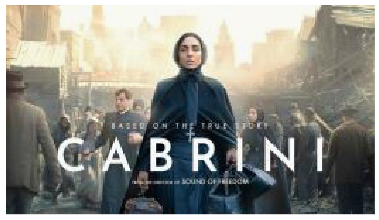
Part of the poster for Cabrini