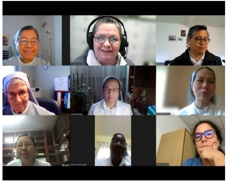
Image from the First Webinar from the International Catechetical Commission of the FMA.