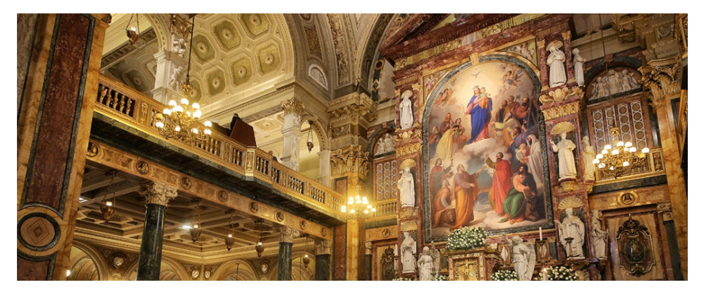
Maria Auxilium Christianorum, ora pro nobis!