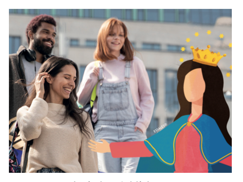
Image from the promotional ad for the course.