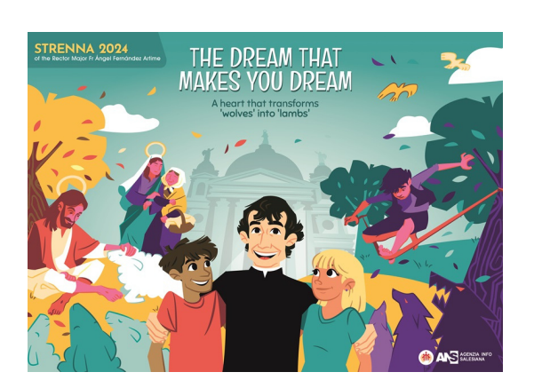
Let Us Live the Dream That Makes Us Dream