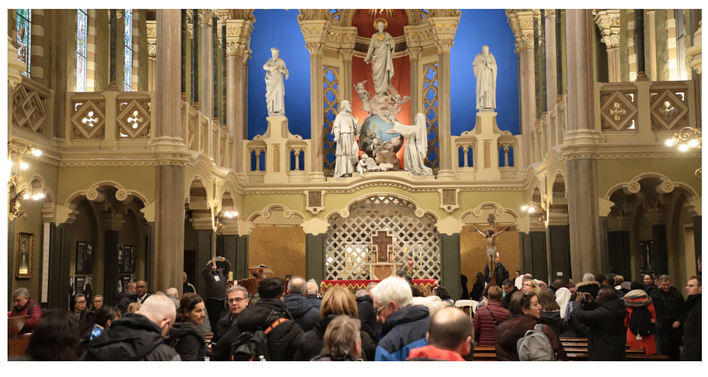
A portion of the Salesian Family Spirituality Days attendees during their visit to the church at Valsalice