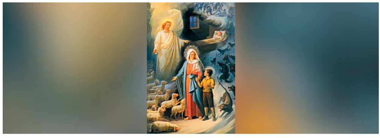
A painting of Don Bosco's dream of nine-years-old.