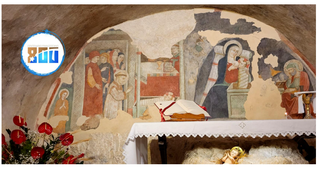
Promotional image for the 800th anniversary of the Nativity scene at Greccio

According to St. Bonaventure, a miracle also occurred on that night and someone noticed St. Francis holding the Christ Child.