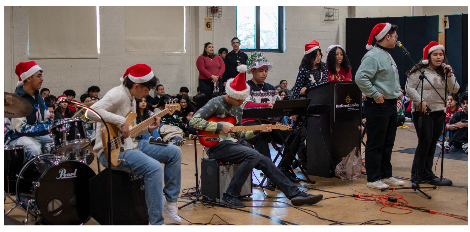
Don Bosco Cristo Rey High School students celebrate the joy of Advent and Christmas at convocation.