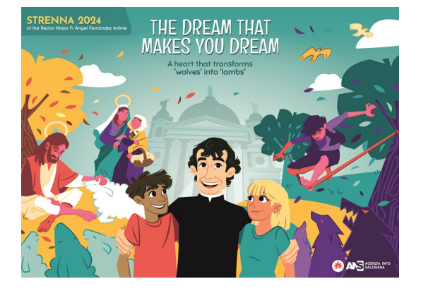
Let Us Live the Dream That Makes Us Dream