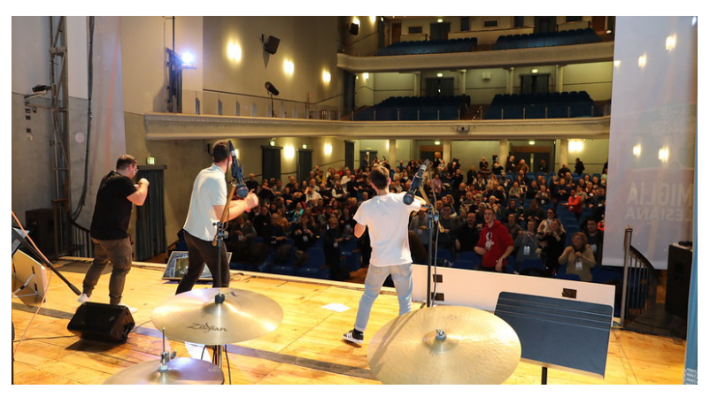
Live performance during last year's SF Spirituality Days in Valdocco.