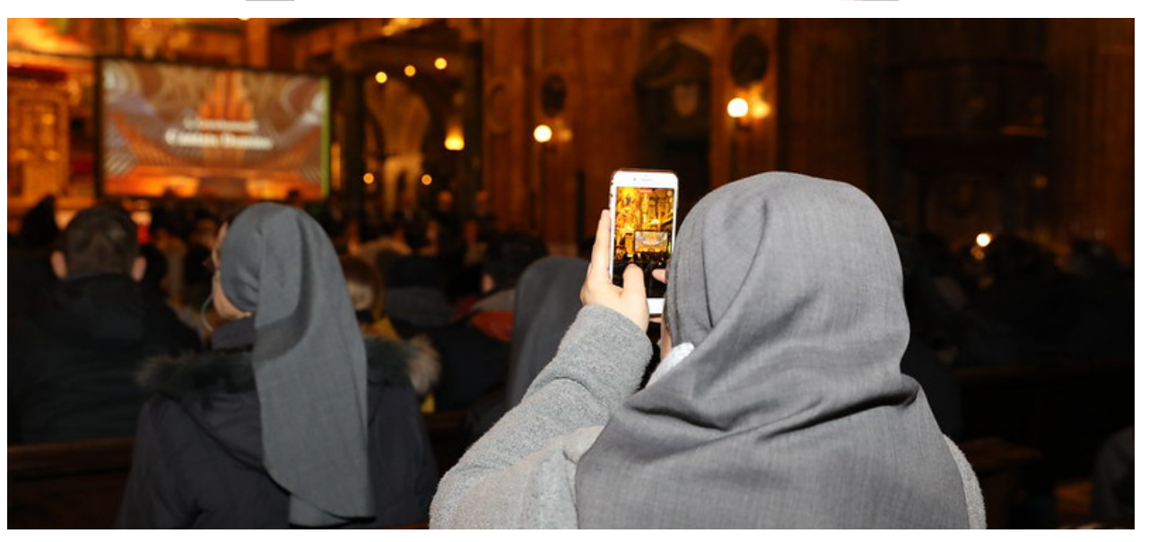
A Salesian Sister takes a photo or video during last year's SF Spirituality Days in Valdocco.