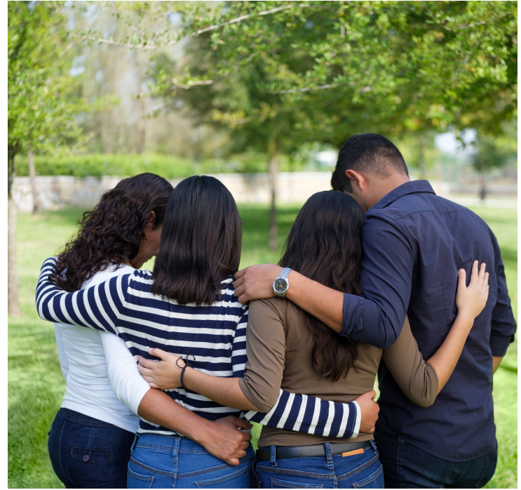
Back view of a family embracing and praying together