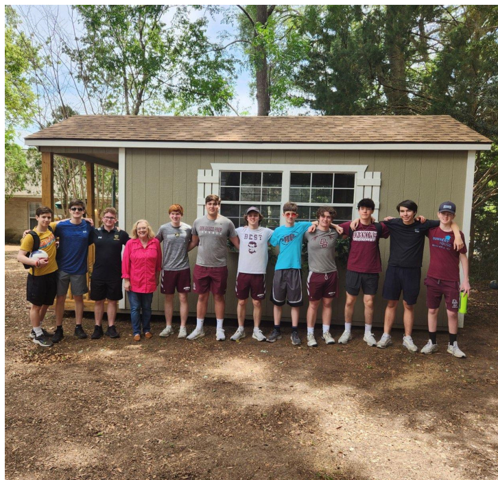
Don Bosco Prep students during their visit to Don Bosco Children's Home in Hernando, FL