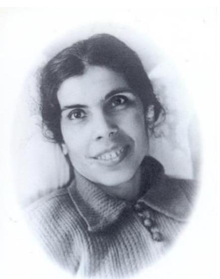
Beata Alexandrina Messaggera di Gesù